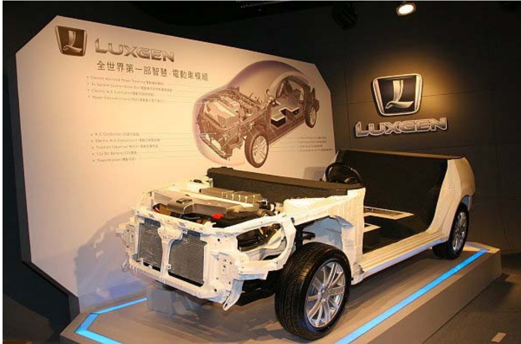
The LUXGEN EV mockup featuring AC Propulsion power